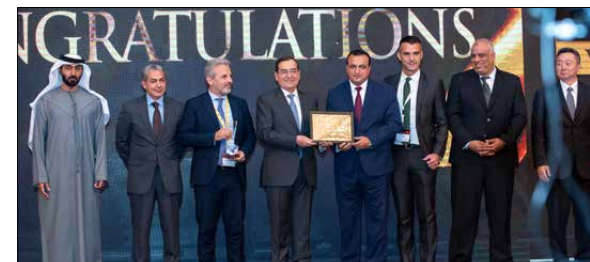
OPERATIONAL EXCELLENCE AWARDS