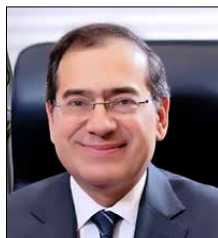
H.E. Tarek El Molla Minister of Petroleum & Mineral Resources