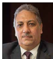
Alaa El Batal CEO - Egyptian General Petroleum Corporation (EGPC)