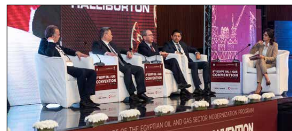
SUSTAINABLE DEVELOPMENT FEATURE