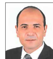
Alaa Hagar Under Secretary for Minister's Technical Office - Egyptian Ministry of Petroleum & Mineral Resources